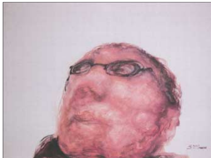
Zhao Nengzhi, "No. 8", 2003, Oil on Paper, 109 x 79 cm

Swollen and hysterical shapes with ambiguous emotions, vague and empty grey background, entangled and knotted touches: a series of works by artist Zhao Nengzhi, dominated by human faces and called "Facial Expression," started unfolding in the late 1990s. The works persistently articulated ambiguous, undefined emotions with richly varied language. Many have tried to explain and attribute such emotions to the contemporary sense of distance and absurdity. Inter-