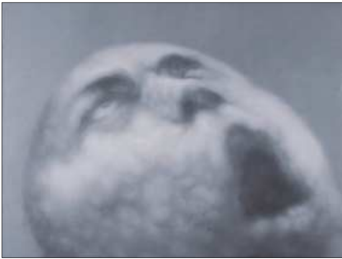
Zhao Nengzhi, "No. 6", 2002, Oil on Canvas, 150 x 200 cm

recipient of the art work. Zhao Nengzhi is clever. While he seems to hand over the rights to the interpretation, these seemingly simple paintings are full of riddles.