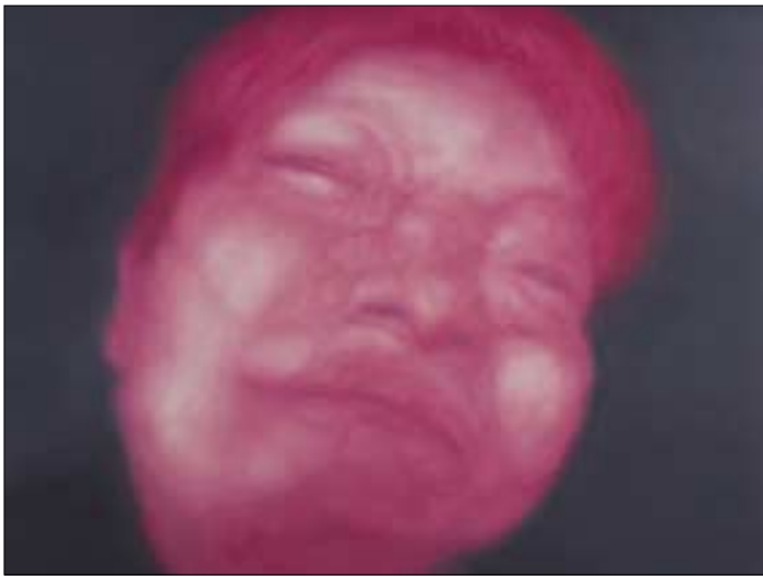
Zhao Nengzhi, "No. 21", 2005, Oil on Canvas, 180 x 230 cm

Zhao Nengzhi is a rational, reflective artist as much sensory as he is in his work. He once wrote in his notes: "I believe art is independent; paintings are paintings. They don't record; nor do they comment or narrate. They are only visual form, color and texture that trigger memory. Art is about gazing, and not pondering; about vision, and not about reason. It displays and not describes. I reject those elements that can be easily defined and implications that can be easily interpreted, but instead seek the variation of language, ambiguity of meaning and potential for growth. Art should argue for the difficulty in comprehension."