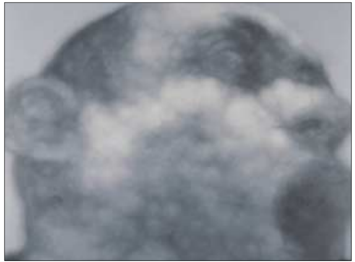
Zhao Nengzhi, "No. 4", 2001, Oil on Canvas, 200 x 250 cm

Those barren bodies have not veered away from the language in which they have spoken over the years. Zhao Nengzhi's bodies are still barren, desolate plains, no matter that they now have clothes on and a seeming identity, and that the colors drop hints – however ambiguous – at time and location.