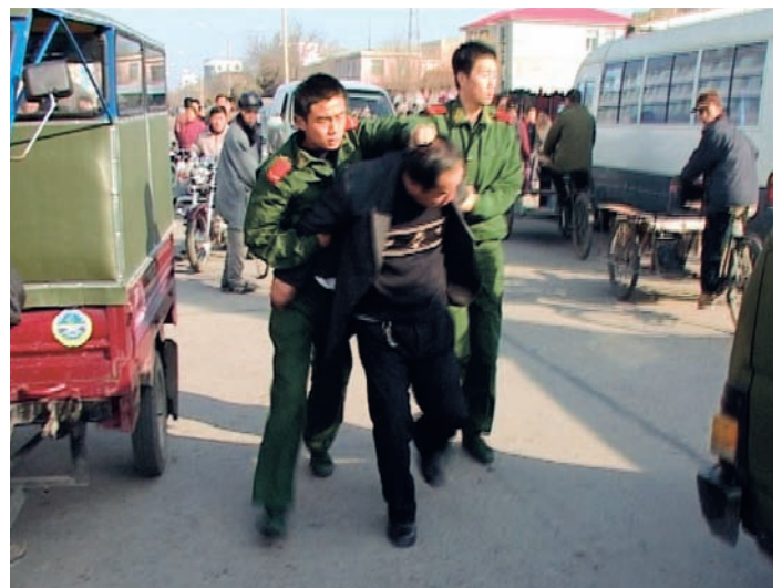
Stills from the video “Crime and Punishment”, 2007, 122 min.