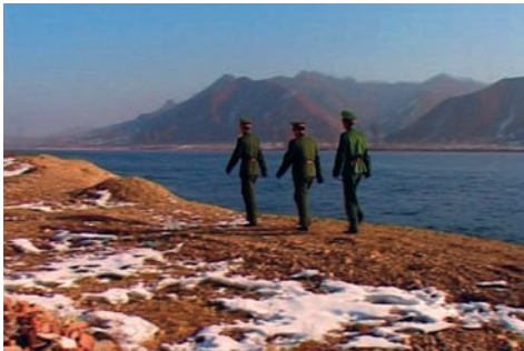
Still from the video "Crime and Punishment", 2007, 122 min.

the stimulating sense of fear and excitement is a sense of perpetual dismay. As one wakes up from the nightmare, the scenes seem to carry on. The significance of this everyday waiting lies in the effacement of that philosophical, aimless waiting in Waiting for Godot .