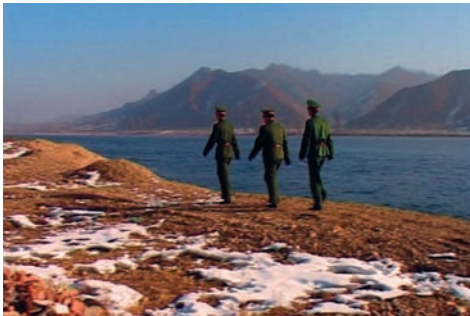
Still from the video "Crime and Punishment", 2007, 122 min.

the stimulating sense of fear and excitement is a sense of perpetual dismay. As one wakes up from the nightmare, the scenes seem to carry on. The significance of this everyday waiting lies in the effacement of that philosophical, aimless waiting in Waiting for Godot .