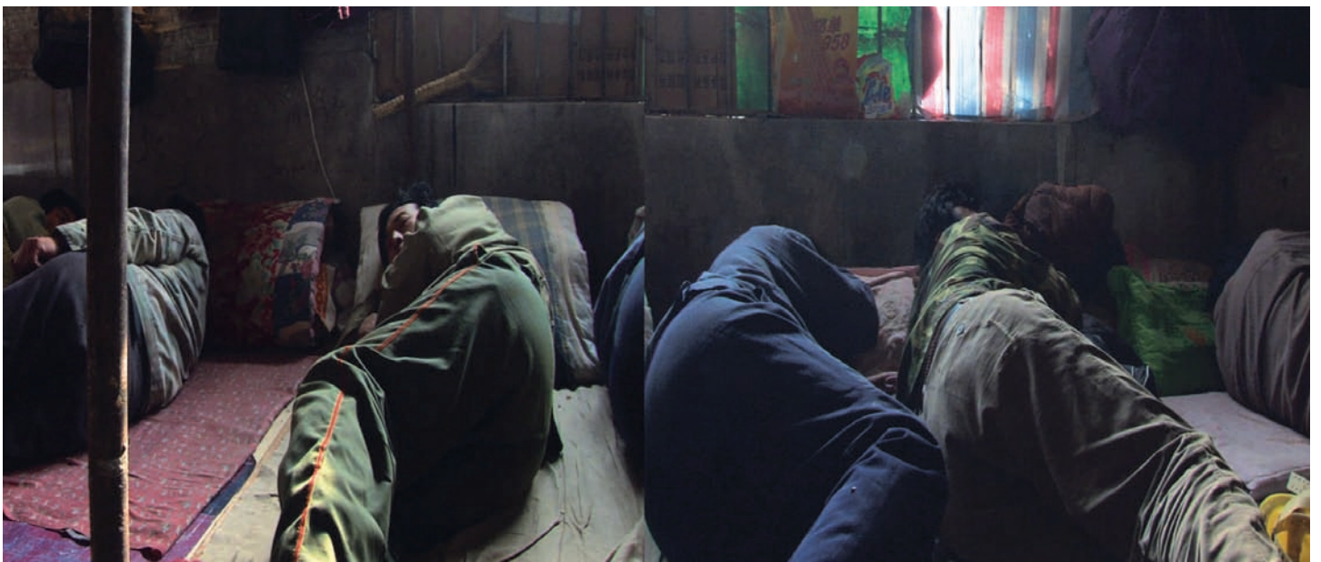
Stills from the video: "Havey sleepers", 2006, Two channel Video, 24 min.

Crowd shows waiting crowds – a crowd waiting for the bus, a crowd waiting to witness the ceremony of raising or lowering the national flag, and a crowd waiting to review the troops. Zhao Liang shoots these common sights with a keen "sense of occasion", revealing a specific psychological state: as one waits, one hesitates with anxiousness, displaying fear out of vulnerability or even ignorance. Yet all these emotions are depicted through the most common, everyday scenes that make me feel as if I am standing in the crowd too, provoked by the same emotions and psychological states of excitement and fear. As these emotions abate, what follows