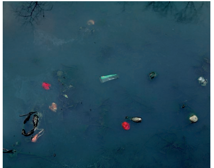
"Water", 2006-7, C-Prints

His video City Scene eschews functioning as a typical documentary while undeniably "documenting" a side of China that has hitherto largely escaped being captured on film. In a series of short, filmic vignettes, his composite picture of Beijing and its residents – who let themselves be massaged in front of a huge construction site, brutally beat one another until blood flows, lose themselves in drunkenness, or dance to playback music on a bridge over the city expressway – is a strangely poetic portrait of the contemporary Chinese metropolis. His subjects seem to react aggressively or stoically to the changed urban and social conditions in scenes that at first may appear ambiguous and often only come into focus moments before one vignette is replaced with the next. Zhao examines the new China, with its episodes of irrational violence and sudden glimpses of tolerance, in accidentally found (metaphorical) scenes of everyday life. He never com-