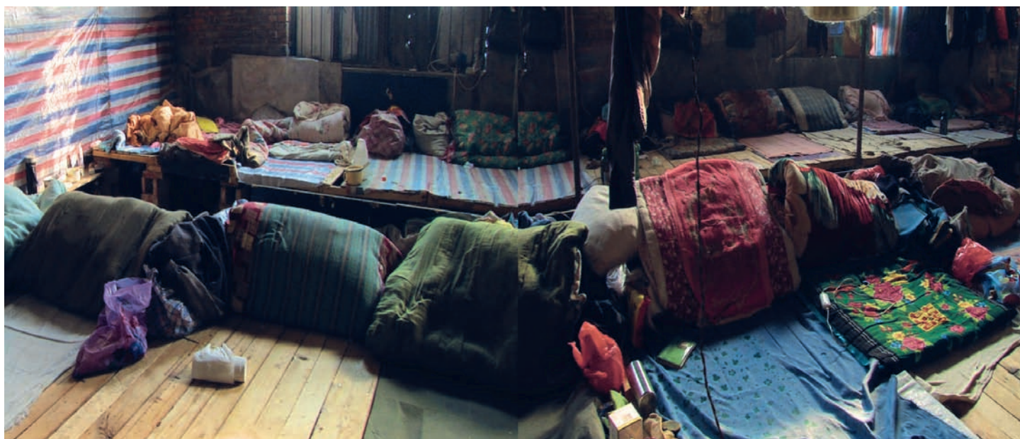
Stills from the video: "Heavy sleepers", 2006, Two channel Video, 24 min.

Narrative Landscape is a piece about the Great Wall. In comparison to raindrops on a lotus leaf or other videos of the quotidian, this one resembles filmic poetry. It commences with mountain ranges in grim tones, vast and obscure, an image of desolation. With the bird's chirping, we gradually see the flowing Great Wall on the spine of the mountains. As the camera draws closer, we see there is nothing but remnants of the ruin. As the wind picks up, trees and wild grass dance with the wind. In the distant sky, a sandstorm rushes towards this direction, and the wind gusts relentlessly towards the microphone, making this sandstorm in the distance resemble a roaring cavalry marching forward. The final shot is a close-up of the remnant ruins: a feeble flower swings with the wind, one can still hear the vague chirping of the birds, spring seems to be on its way, but the sky and the mountains are nevertheless desolate. The technical mistake of hearing gusting wind against the microphone in this case compliments the images of the work.